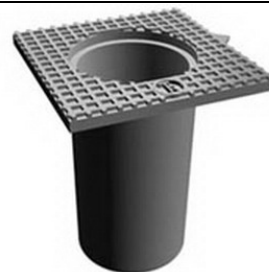
Installation in Brick