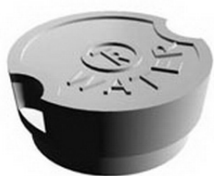
Most Common installation